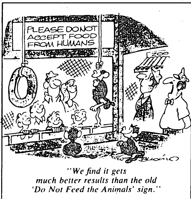
"We find it gets much better results than the old 'Do Not Feed the Animals' sign."